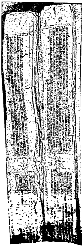
Portions of the palm-leaf Ms. (No. 58 of 1880-81, Bhandarkar O. R. Institute, Poona), folios Nos. 44a (half) and 43b (half), of the Vise-āraś'akabhāṣyavitt , see the Intro p. 6, footnote 1.